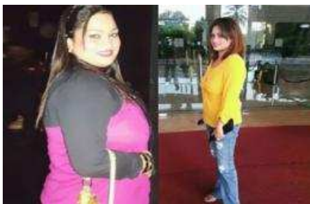
1 Magical Trick Helps You Lose