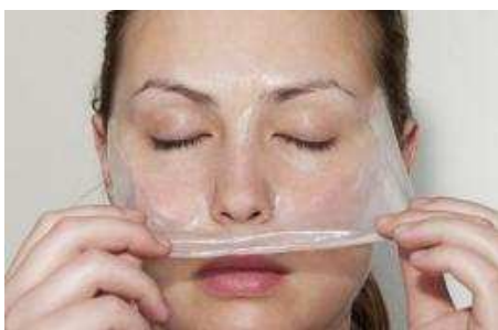
चेहरा एक रात में 15 साल छोटा लगने लगेगा!