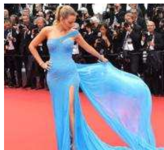
Hottest Cannes Film Fes