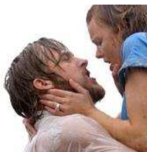
Top 30 Films To Get You Mood